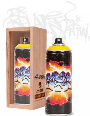
Fab 5 Freddy Tribute art.

With contributions to the seminal classic hip-hop films, "Wild Style and "Style Wars", his participation in the 80's East Village art gallery scene, various music videos and, album covers, animation, comics, vinyl toy design, and creating the classic "YO! MTV Raps" logo. His early 80's tour of duty in the city of Baltimore is legendary, where he, like a "Messenger of Style", singlehandedly kick-started a graffiti scene there that still feels his influence today.